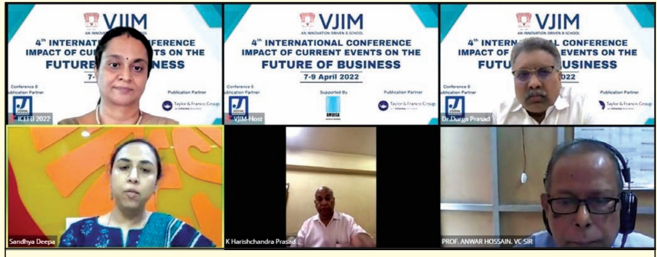
Glimpse of the 4th International Conference on "Impact of Current Events on the Future of Business" By Vignana Jyothi Institute of Management, Hyderabad

The 4<sup>th</sup> International Conference on 'Impact of Current Events on the Future of Business' (ICEFB'2022) was conducted by VJIM Hyderabad from 7 April to 9 April 2022. The 3-day hybrid mode conference featured 38 presentations under 6 tracks, 2 plenary sessions and 1 panel discussion focused on different dimensions of the theme 'Building Resilient Organizations'. The overall event witnessed offline and online presence of around 180 inquisitive intellects as guests, speakers, experts, researchers and delegates from 12 countries all around the world and 13 states across the country. The conference was supported by AMDISA as academic partner, Journal Press India as conference partner and Taylor & Francis Group, UK as publication partner.