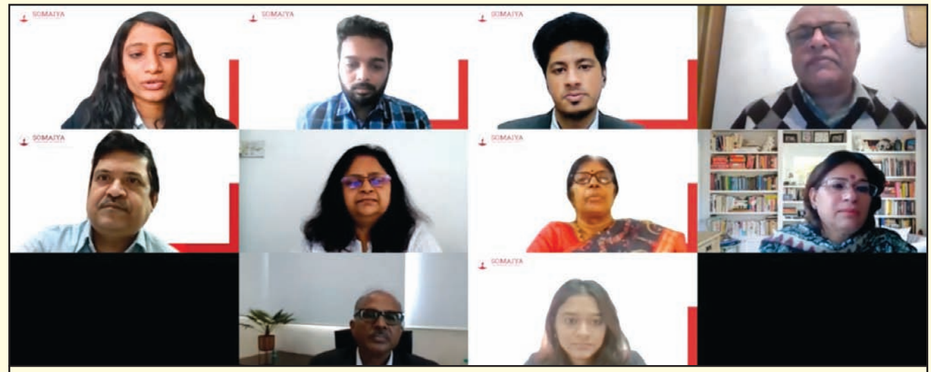
Glimpse of the 8th International Conference on "Economic Analysis for Contemporary Global Business" by K J Somaiya Institute of Management, Mumbai