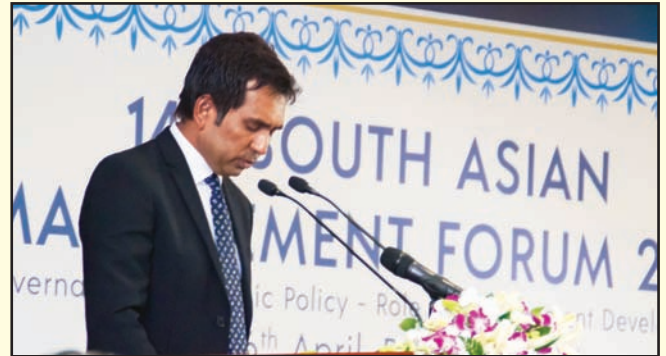
Inaugural Address by Hon. Mr. Mohamed Saeed, Minister of Economic Development, Maldives