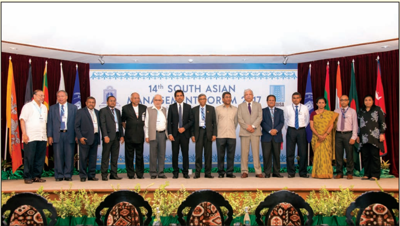
Dignitaries at the inaugural

South Asian Management Forum (SAMF) is a biennial conference organized by the Association of Management Development Institutions in South Asia (AMDISA). The forum aims to bring together management experts, scholars, practicing managers, business leaders, policy administrators and other academicians from different countries of South Asia on a platform to discuss various connected issues and share their research findings. The 14 th SAMF 2017 hosted by MNU Business School, Maldives National University, Male, Maldives was held at Bandos Island, Maldives from April 24-26, 2017. The earlier conference was held in Colombo, Sri Lanka in 2015.