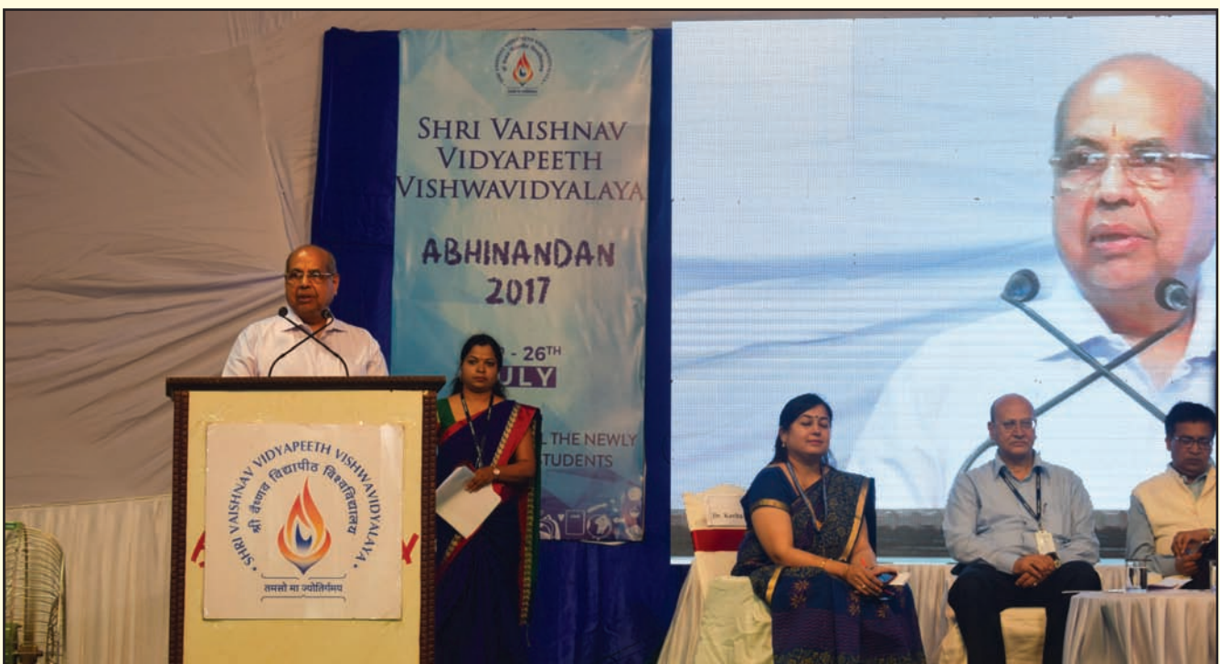
A photo at the programme