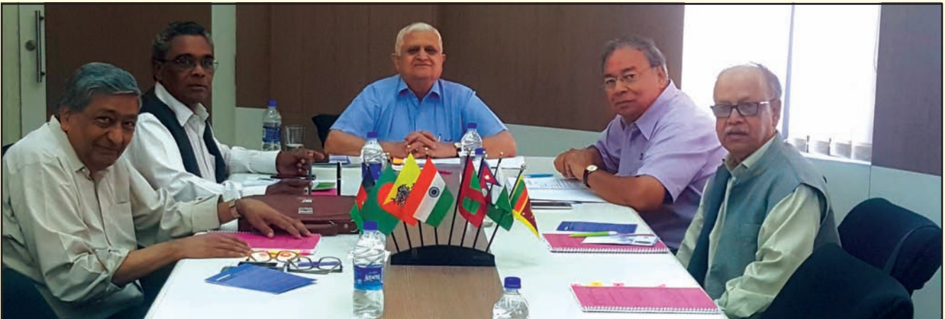
18 th SAQS Committee Meeting