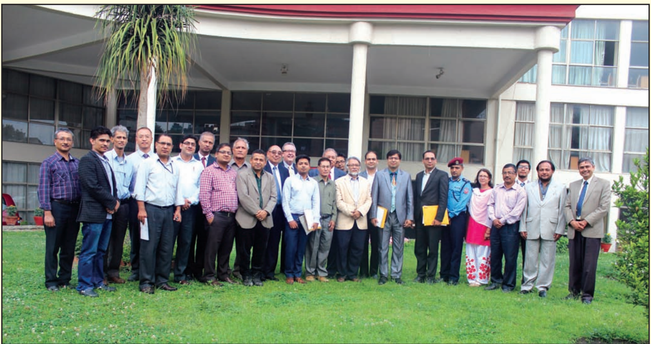
Participants of the program at KUSOM, Nepal