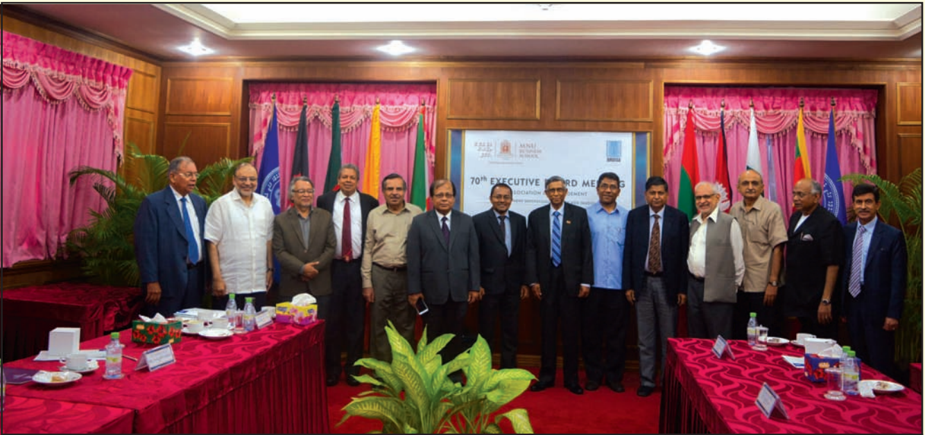
70 th Executive Board Meeting