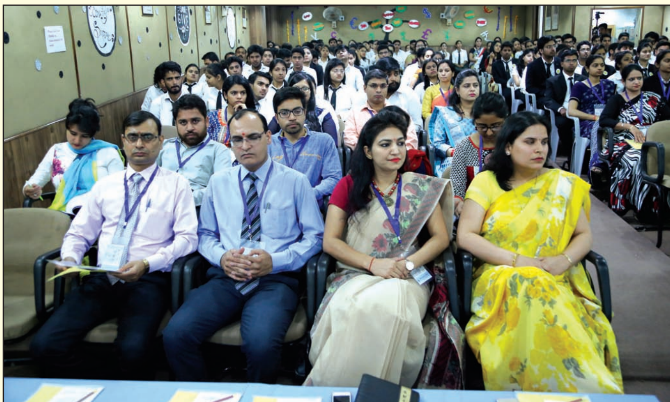
Delegates at the International Conference