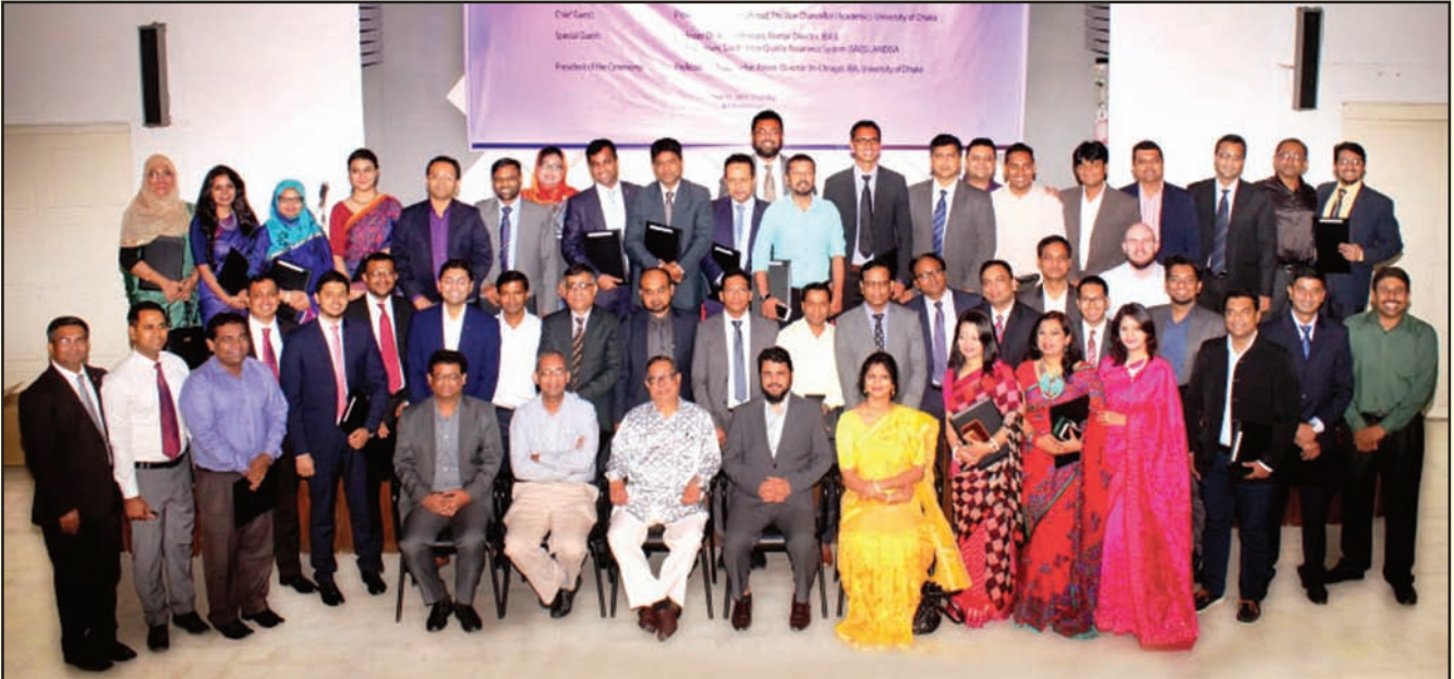
Participants of ACBA Batch-9 with the Guests