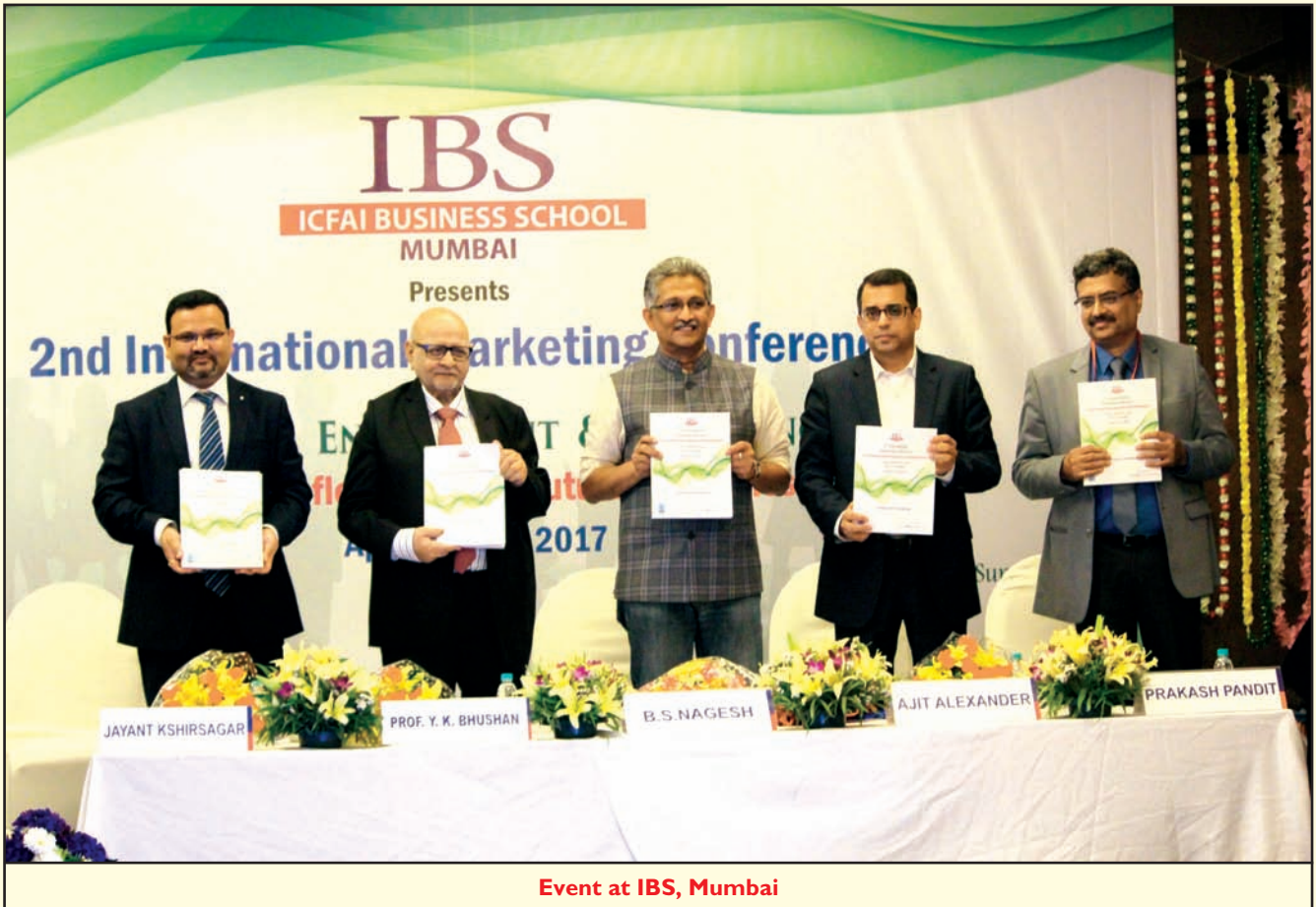
Event at IBS, Mumbai