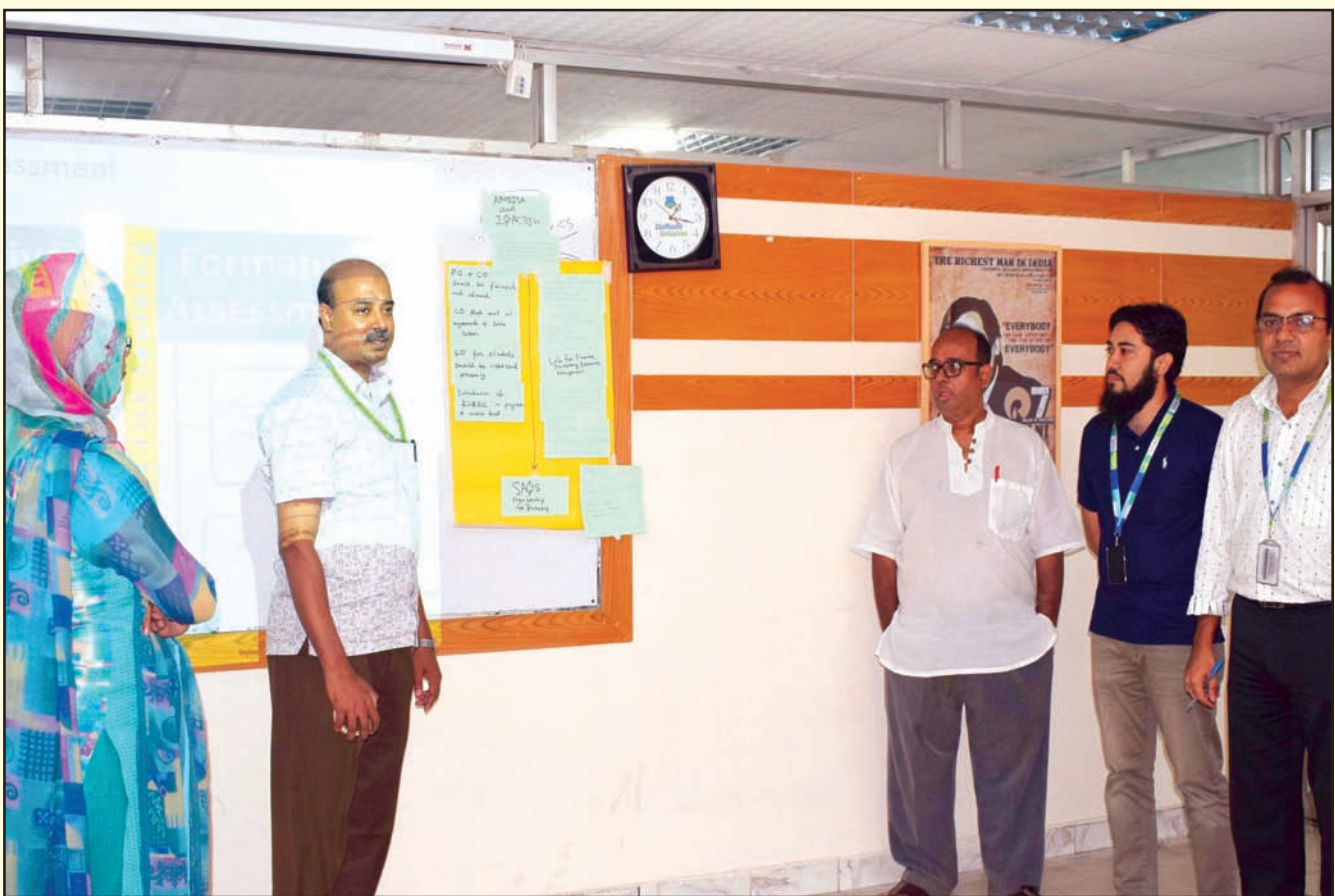
A photo at the event of Daffodil International University