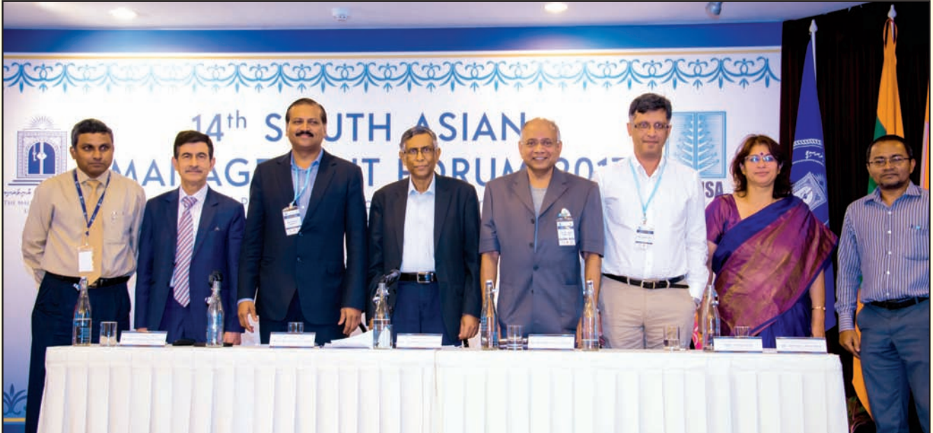
Panel Session V: International Best Practices in formulating Public Policies