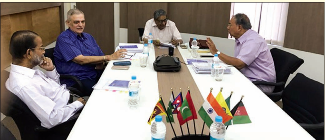
9 th SAQS Accreditation Awarding Committee Meeting