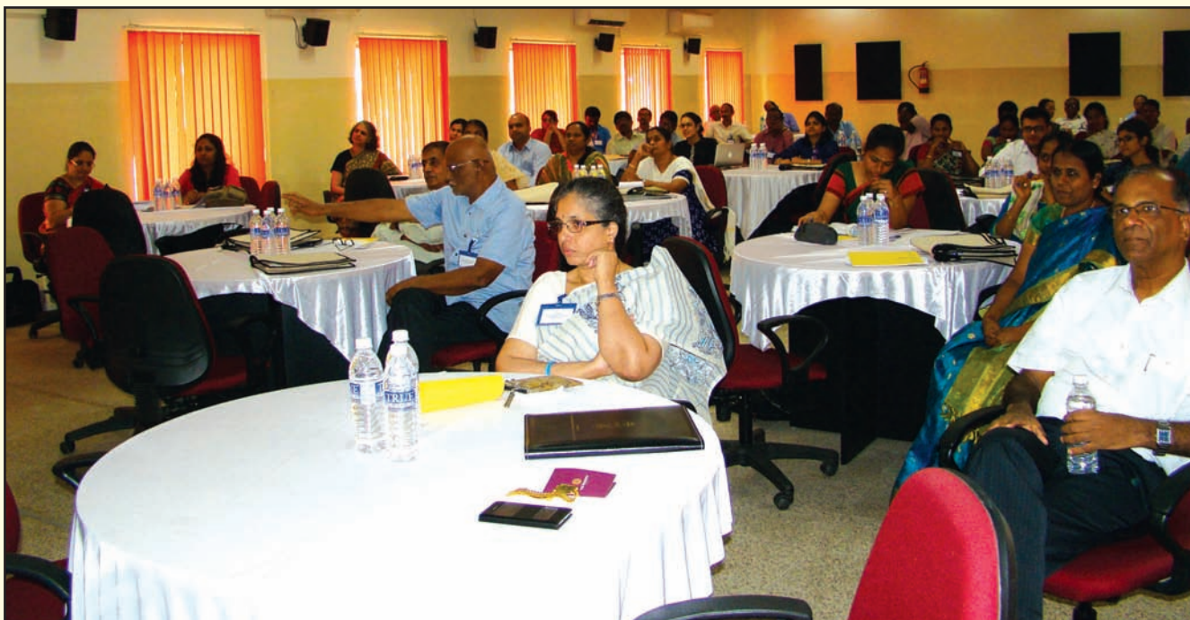
Delegates at the Case Conference