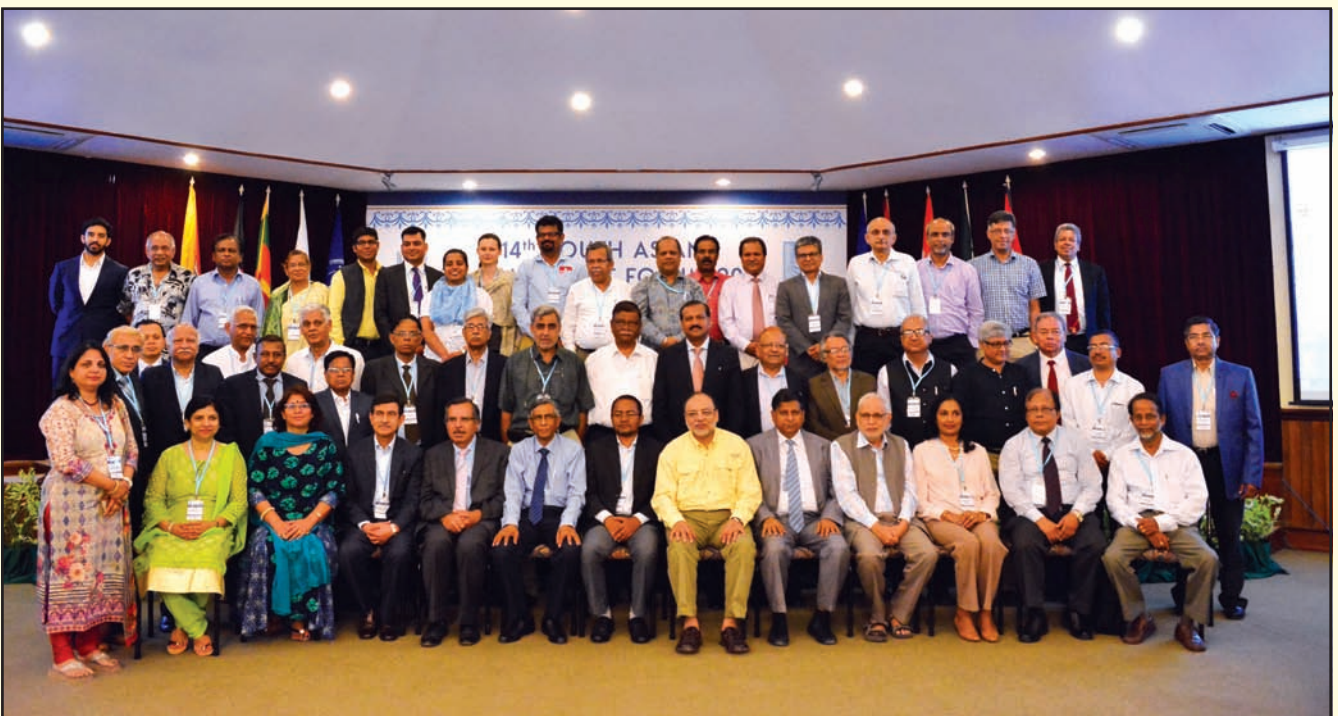
Group Photo of Delegates at the Conference