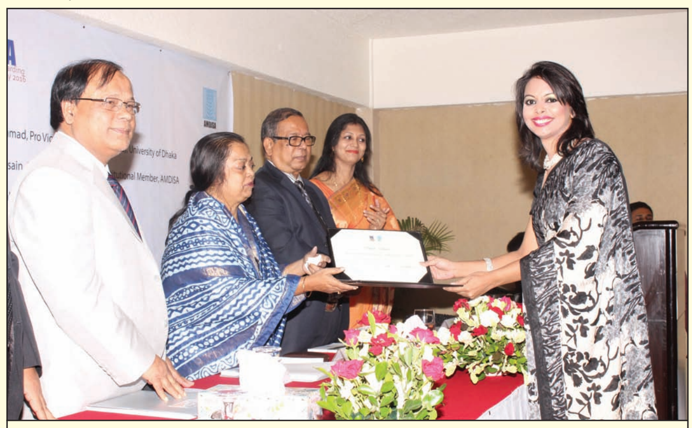
Participant Receiving Certificates from the Chief Guest

The atmosphere was electric and the participants were the centre of attention. They also were very excited about the networking they had during this course and remarked that this bonding will help them reach newer heights. Friends and family members of the participants were present there to celebrate the success of the participants. Deans of different faculties of Dhaka University, members of IBA Board of Governors, Faculty members of IBA, and important corporate personalities were also present at the ceremony. The certificate awarding ceremony was followed by dinner.