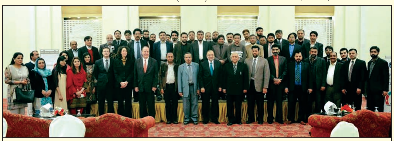
Delegates at the Colloquium

South Asian Colloquium on Doctoral Programs (SACDOC 2016) was organized on Tuesday 16<sup>th</sup> February, 2016 by University of Management and Technology (UMT) in association with Association of Management Development Institutions in South Asia (AMDISA), Association of Management Development Institutions in Pakistan (AMDIP), National Business Education Accreditation Council (NBEAC) at Hotel Pearl Continental, Lahore, Pakistan.