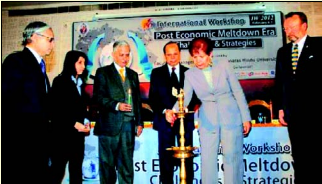
Inaugural of the Workshop at BHU, Varanasi

The Two-day international workshop on Post Economic Era - Challenges & Strategies was organized by Faculty of Management Studies, Banaras Hindu University (FMS-BHU) in association with AMDISA, SAARC & Alliance University, and Bengaluru on February 4-5, 2012 at Banaras Hindu University.