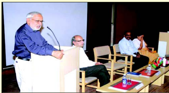
SAARC Charter Day Celebration at IndSearch, Pune