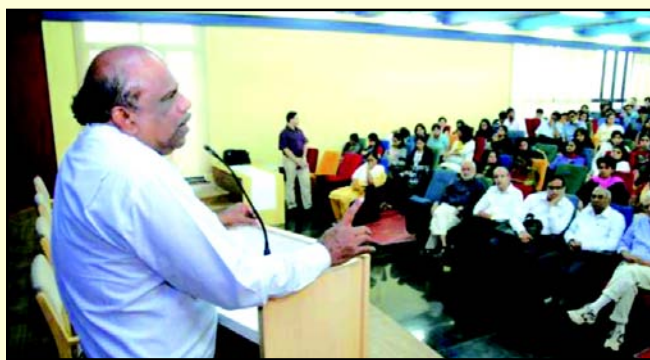
SAARC Charter Day Celebration at IndSearch, Pune

how technology leadership and networking can help to reduce poverty in the SAARC countries. SAARC will be the source for knowledge and innovation for the whole world in the years to come.