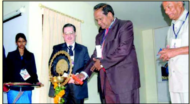
Inaugural of the Convention at ASBM