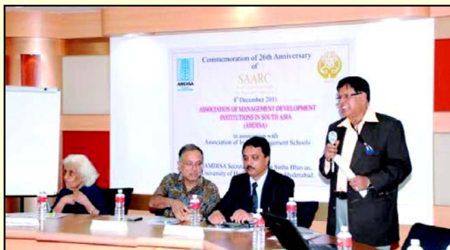
SAARC Charter Day Celebration at AMDISA