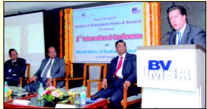
Mr Aldo Ruiz, Trade and Investment Commissioner, Ministry of Economy, Mexico, giving Keynote Address

good diplomatic relations with Mexico, the new generation of Indian entrepreneurs can target the whole of North American continent for International Business.