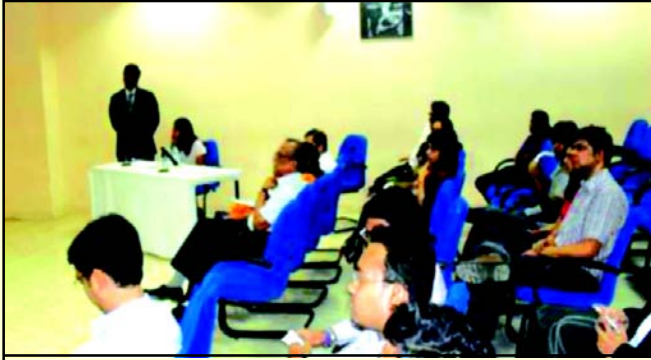
SAARC Charter Day Celebration at IBS, Mumbai

EU nations, health, education and upliftment of poverty, role of India in SAARC and an affirmation of the objectives of SAARC. Issues of concern voiced were that of increasing mistrust and lack of unity between member nations, which come in the way of the achievement of SAARC objectives, rising terrorism in the sector and a need for realignment of the objectives.