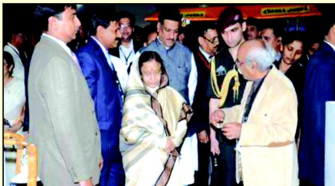
Hon'ble President of India Smt. Pratibha Devisingh Patil

(i) Hon'ble President of India Smt. Pratibha Devisingh Patil inaugurated the Welingkar Institute of Management Development & Research Contributor Development Lab (CDL) & "dmagics"- design for management and growth in corporations and society exhibition on 13th March, 2012