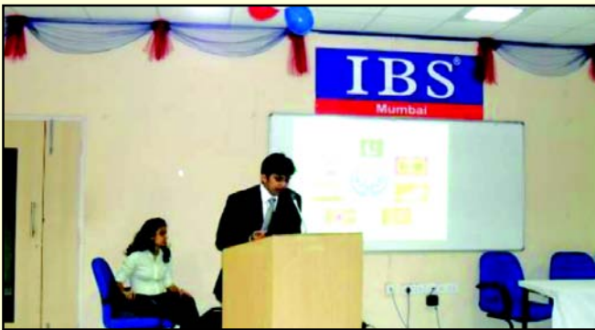
SAARC Charter Day Celebration at IBS, Mumbai

EU nations, health, education and upliftment of poverty, role of India in SAARC and an affirmation of the objectives of SAARC. Issues of concern voiced were that of increasing mistrust and lack of unity between member nations, which come in the way of the achievement of SAARC objectives, rising terrorism in the sector and a need for realignment of the objectives.