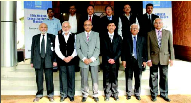
Group Photo of 57th Executive Board Meeting at Dhaka, Bangladesh