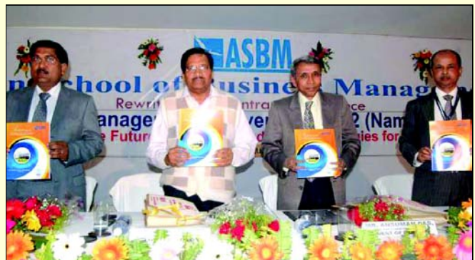
Valedictory of the Convention at ASBM