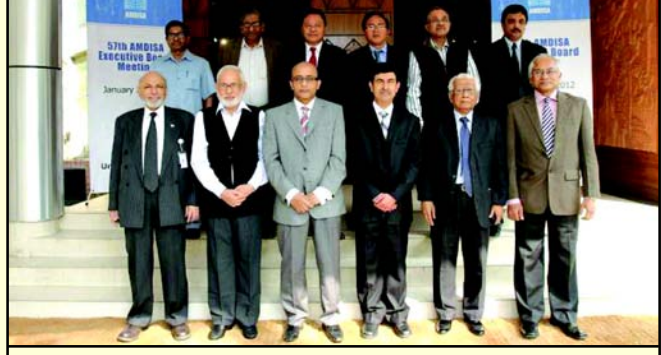
Group Photo of 57th Executive Board Meeting at Dhaka, Bangladesh