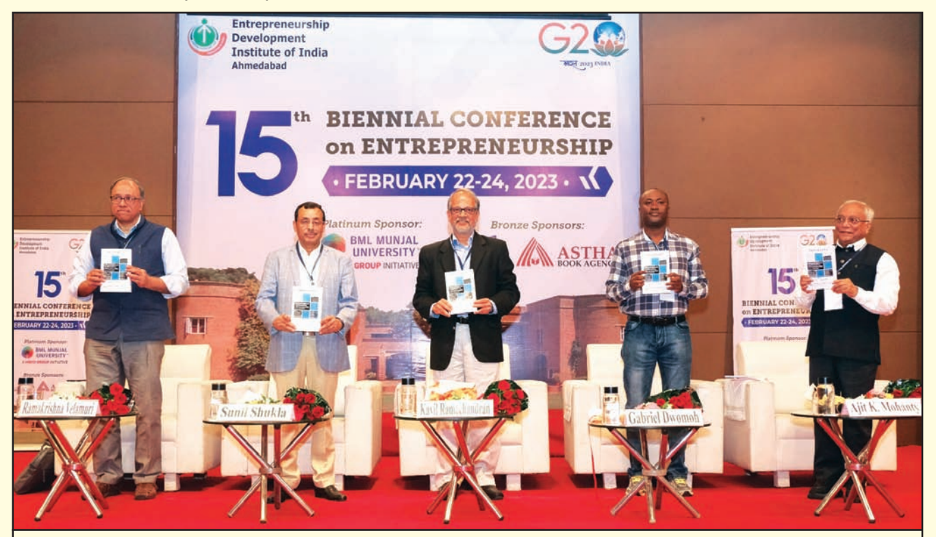
Releasing Abstracts' compilation of the papers selected for presentation at the 15th Biennial Conference

As part of the conference, a Vice Chancellors'/Directors' Conclave was also held to discuss the Importance of Entrepreneurship Education in the Context of the National Education Policy (NEP) 2020. Universities from across the country were represented.