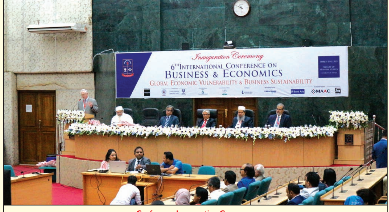
Conference Inauguration Ceremony

The Faculty of Business Studies, University of Dhaka organized the 6th International Conference on Business and Economics on March 01-02, 2023. The Faculty of Business Studies has been organizing this conference regularly for the last six years. This year, the theme of the conference was Global Economic Vulnerability and Business Sustainability. The objective of the conference was to bring together academics and professionals to a common forum for developing strategies to meet global business challenges in the years to come. In addition, the conference created an opportunity to share experiences, exchange new ideas, foster innovation, and establish research relations among the participating individuals and institutions.