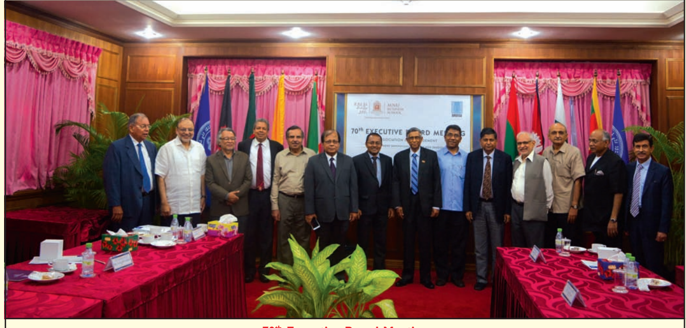
70th Executive Board Meeting